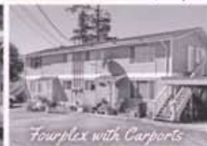
Fourplex with Carports