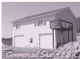
Commercial Shop + 2 BR