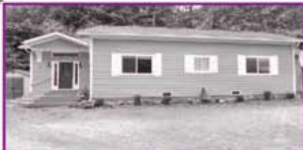
104 Shotgun Alley—3 bedrooms, 2 baths, 1820 sq. ft., $365,000