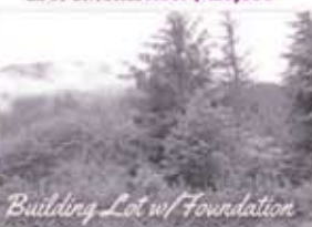
Building Lot w/ Foundation