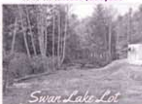
Swan Lake Lot