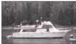
53' Canoe Cove, Great condition! $140,000