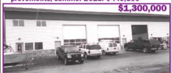
224 Smith St., Mixed-use building Consists of retail space, office space, warehouse and shop plus a 1300 sq. ft. apartment. Owner fin. Option.