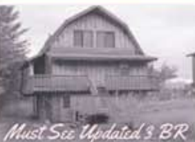
Must See Updated 3 BR