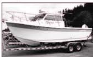
2014 24' Osprey—Tight Lines—Low motor hours, outfitted for fishing. $139,000