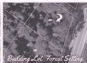
Building Lot, Forest Setting