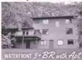
WATERFRONT 3+ BR with Apt