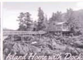
Island Home with Dock