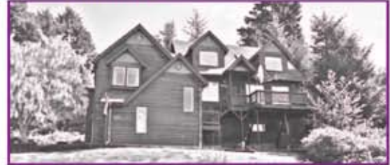
132 Shelikof Dr. Significant foundation improvements, summer 2015. $449,500