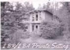
2 BR/2 BA Private Setting