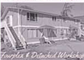
Fourplex & Detached Workshop