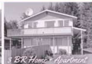
3 BR Home + Apartment