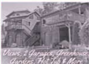
Views, 2 Garages, Greenhouse, Gardens, Hot Tub & More