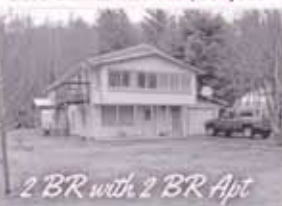
2 BR with 2 BR Apt