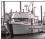
42' Monk design, liveaboard, 3 state rooms $48,000!!!