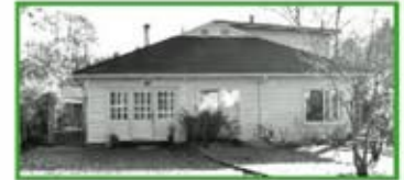
308 CASCADE ST. - The location gives this home appeal! Easily walkable/bikeable from stores, schools, parks. Listed at $349,000

719 ETOLIN ST. - Bright, charming downtown cottage! This three-bedroom home sits on a double-sized lot: 16,290 sq. ft. A 728 square foot garage has two bay doors as well as a large carport. Just waiting for new owners to make it their own. Listed at $449,000