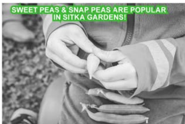
SWEET PEAS & SNAP PEAS ARE POPULAR IN SITKA GARDENS!

R A I S E D B E D S F S X I S N A C K S R X E F L O W E R S E C A R R O T S U F S W E E T P E A S U H K R A D I S H N N S A C D G L O V E S R L Z I H F O O D N V E G E T A B L E S E I S L U G S K X X