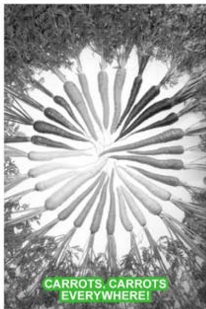
CARROTS, CARROTS EVERYWHERE!