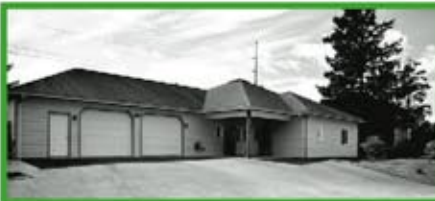
135 LILLIAN DR. - Single floor living with many recent upgrades. Huge garage. $450,000