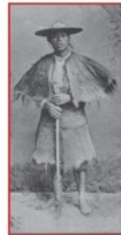
Chinese rain cape & skirt

In Ancient China stiff, thick rain capes were made of straw or grass. Around 1200 AD, Amazonians used the latex-like extract from rubber trees to waterproof their footwear & clothing. When Europeans arrived in 1700s & became aware of this waterproofing, they followed suit.