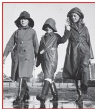
British children in their Mackintosh raincoats, sou'wester rain hats, & rubber wellington boots.

Almost 200 years ago Scottish chemist Charles Macintosh sold the first waterproof rain coat. It is because of his innovation of waterproofed fabric that Mackintosh is referred to as the "inventor of rainwear."